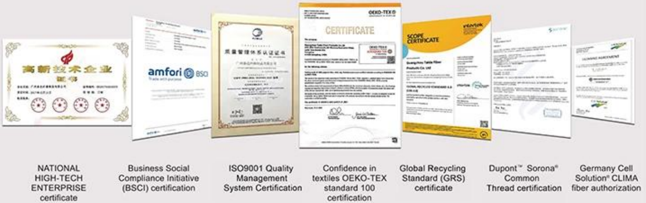
NATIONAL HIGH-TECH ENTERPRISE certificate