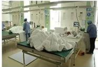
⑧ Product inspection