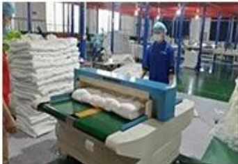
⑦ Needle detectors