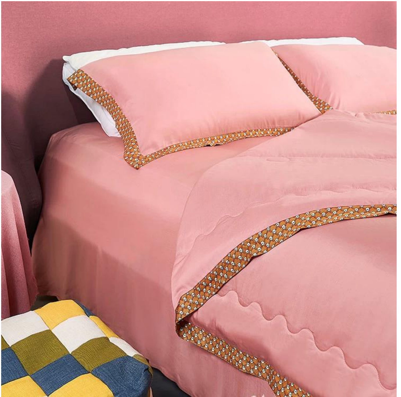
3D spiral fiber filling