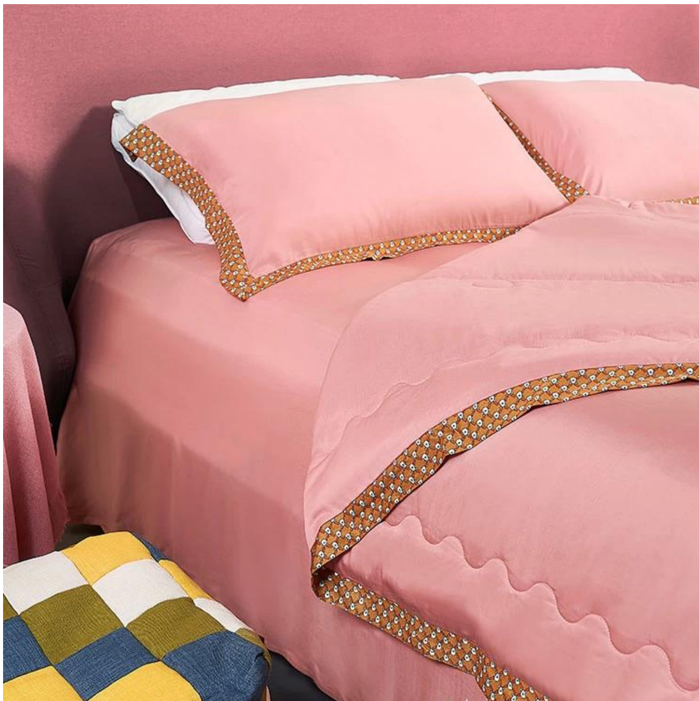
3D spiral fiber filling