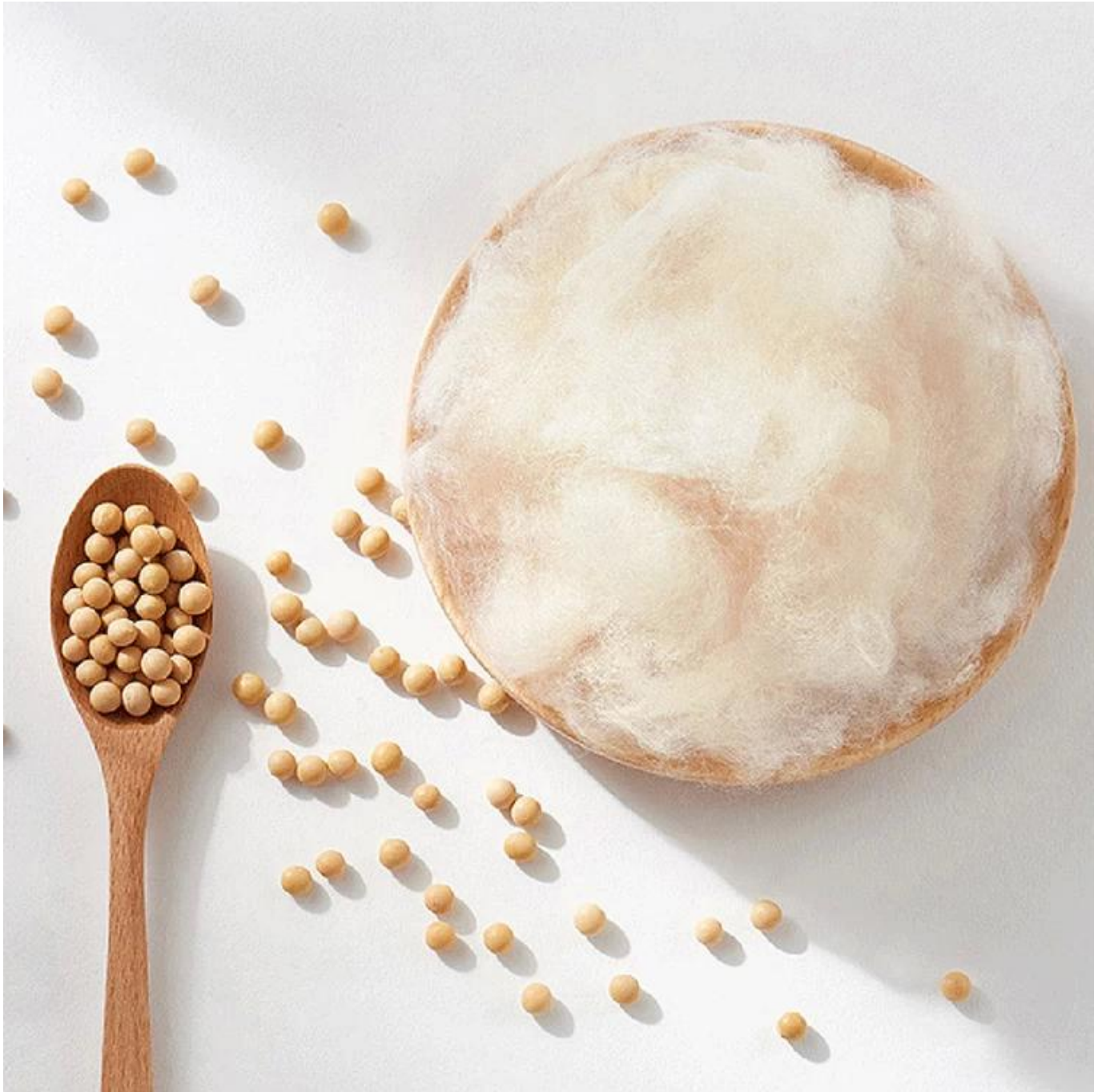
Special Quilted Process