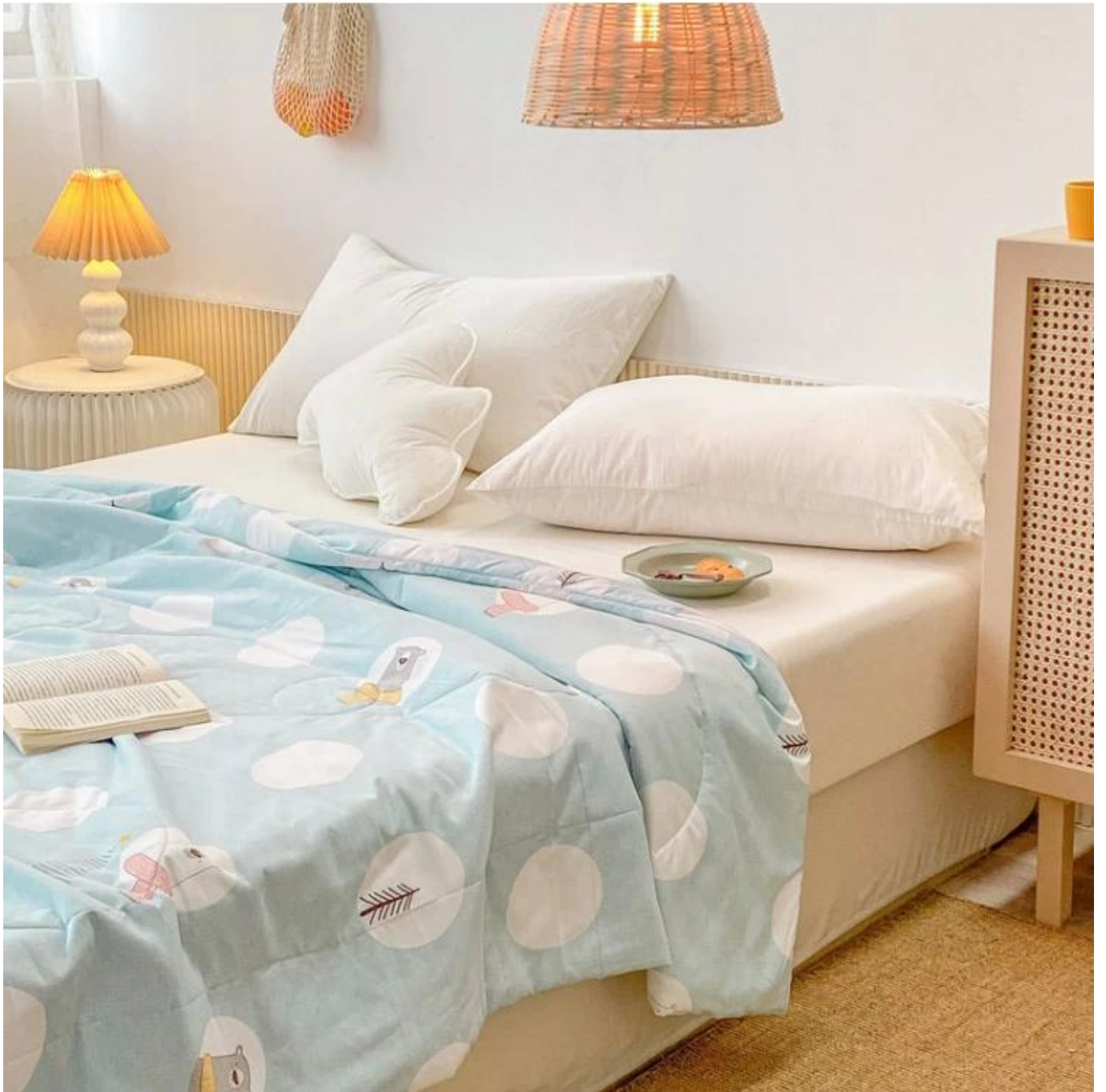
3D spiral fiber filling