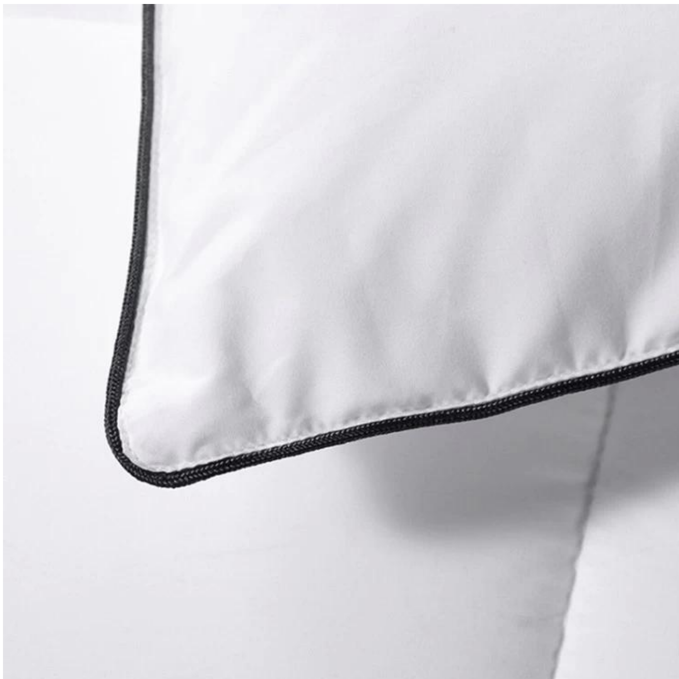
Fluffy high-class hospitality bedding product-soft hotel quilt