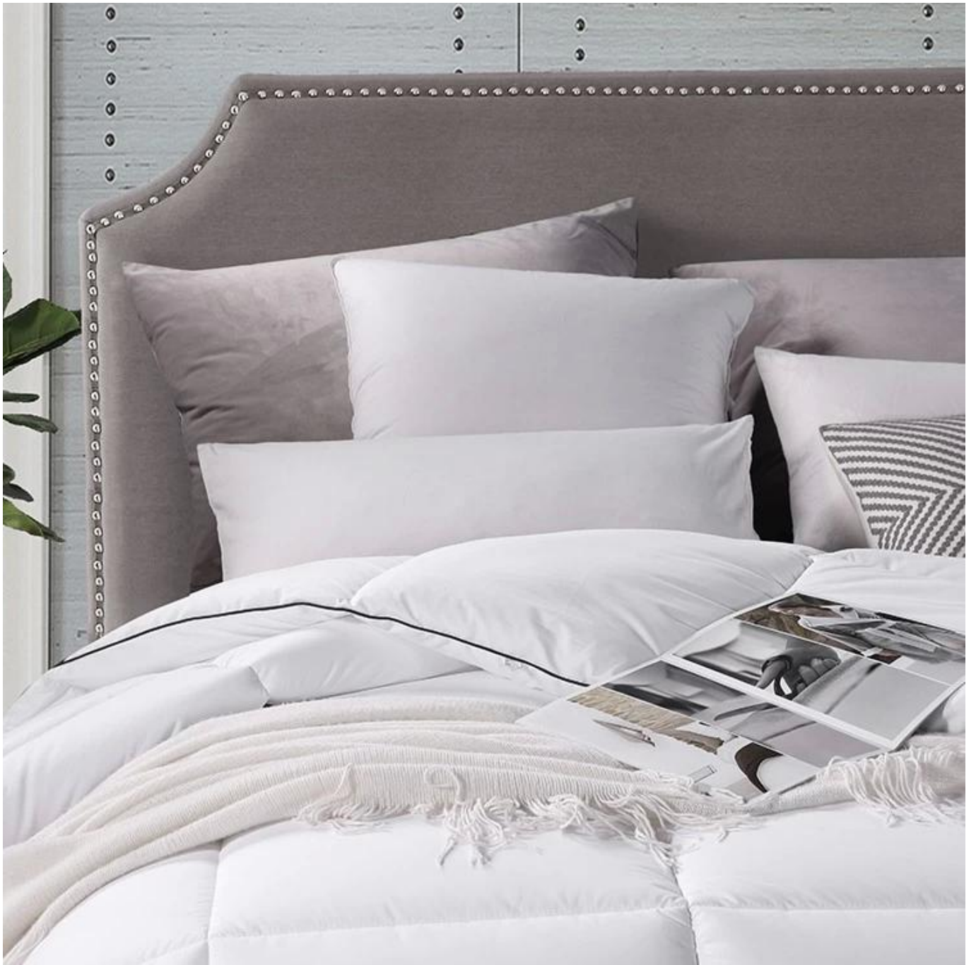
Featured box stitched