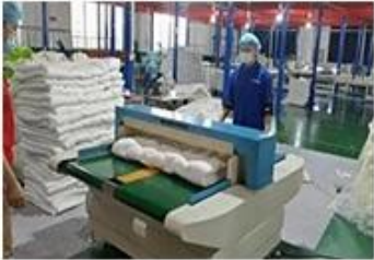
⑦ Needle detectors