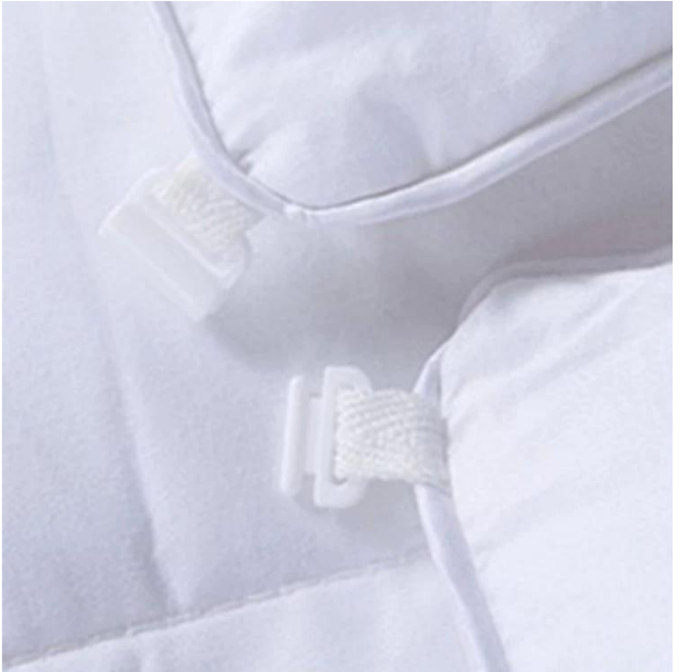
Warm Two In One Quilt