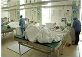
⑧ Product inspection