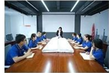
⑨ Finished product