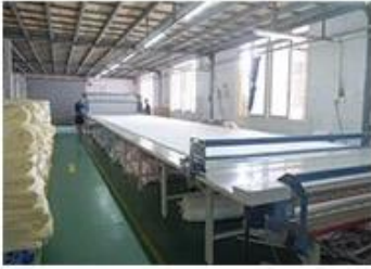
① Fabric inspection