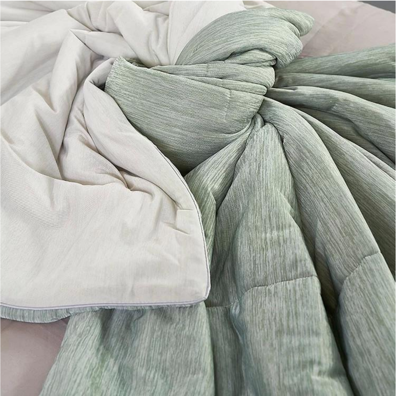
3D spiral fiber filling