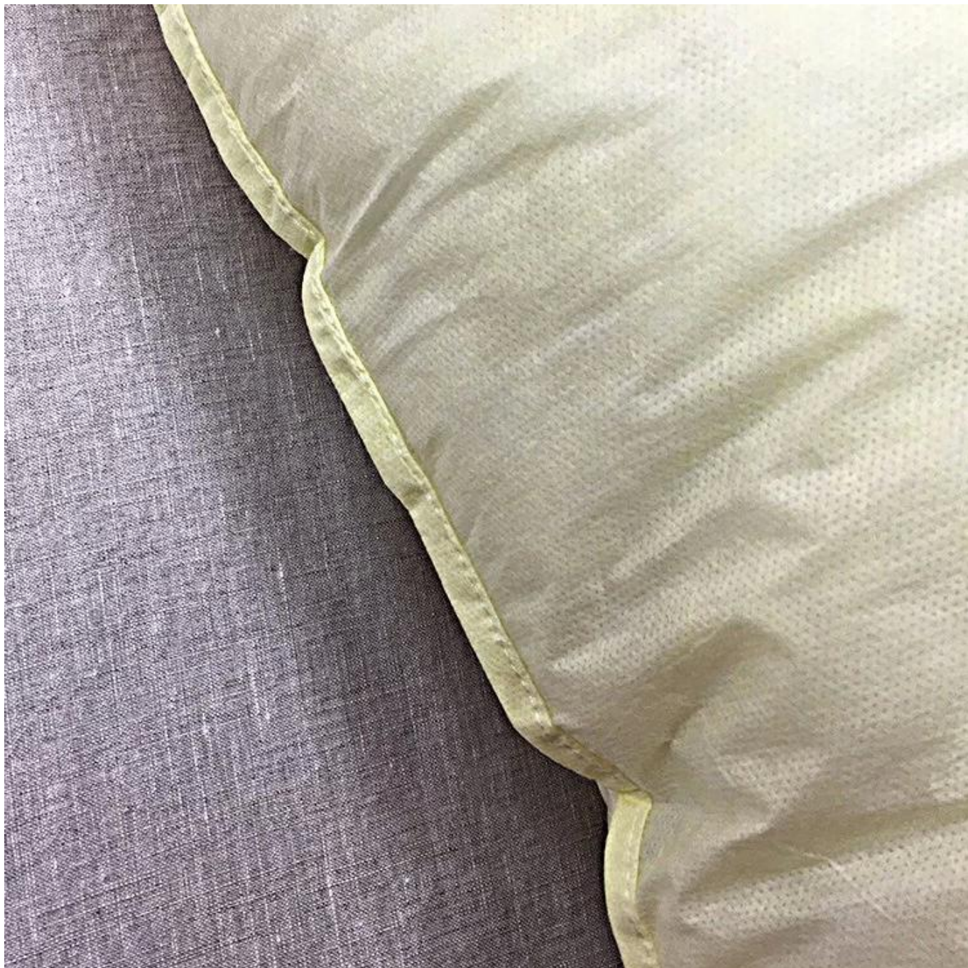
Exquisite hot pressing process