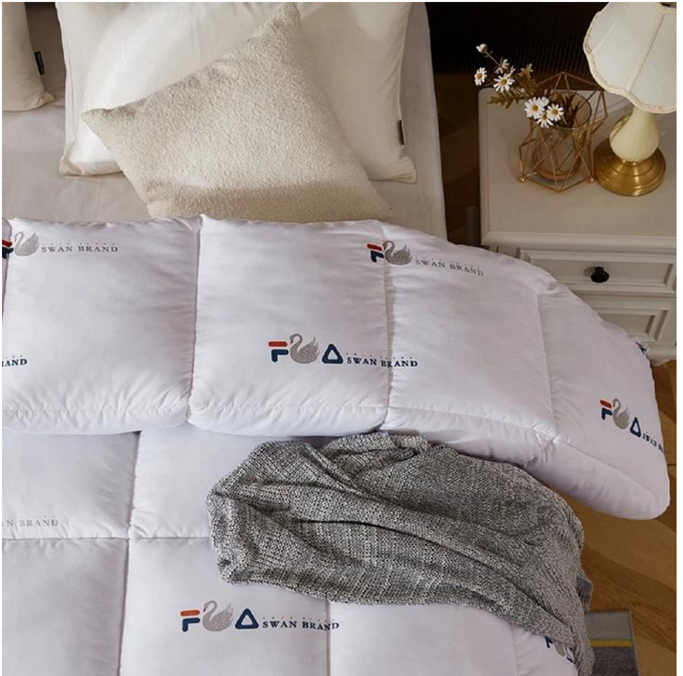
Featured box stitched