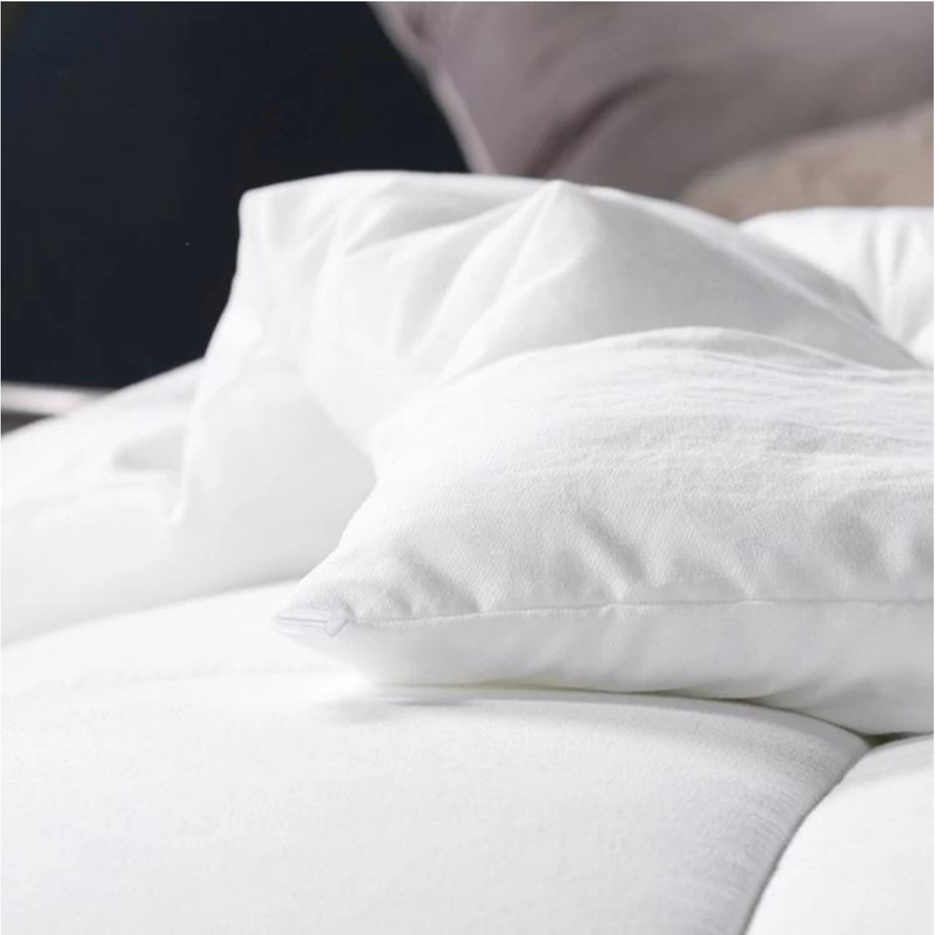
Featured box stitched