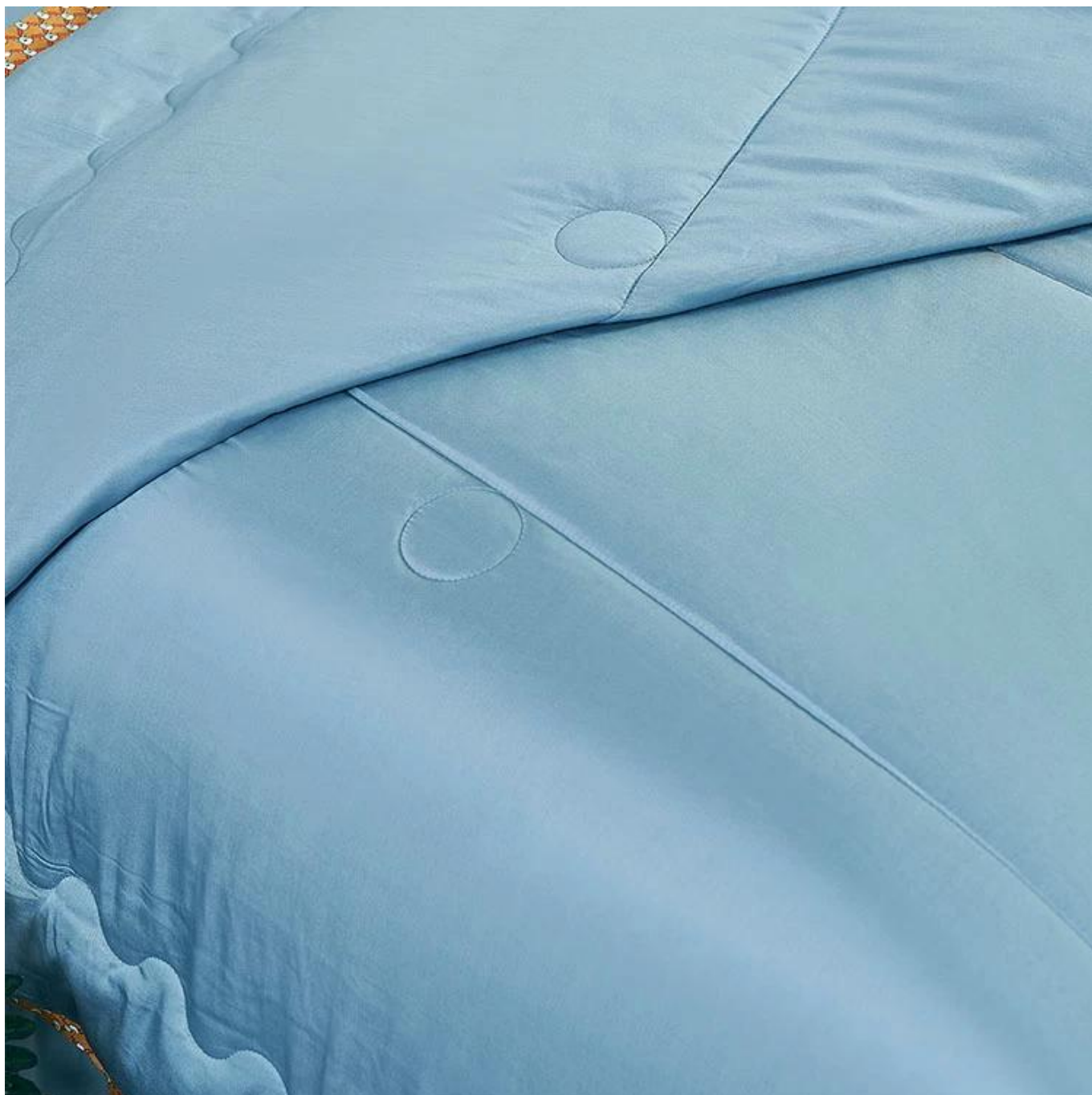
3D spiral fiber filling