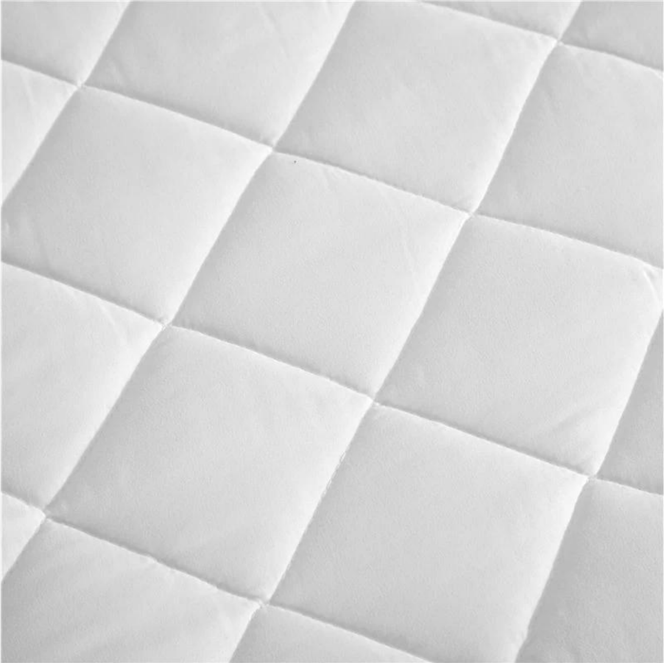
3D spiral fiber filling