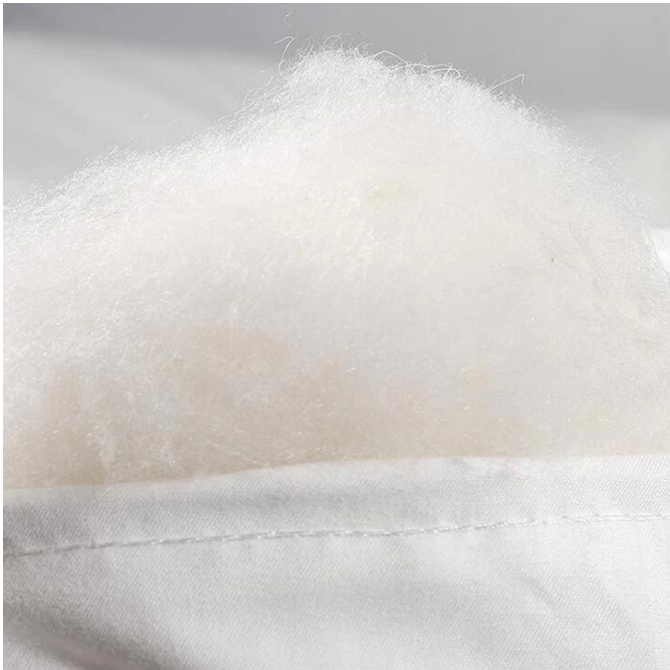
Unique sheep printing pattern