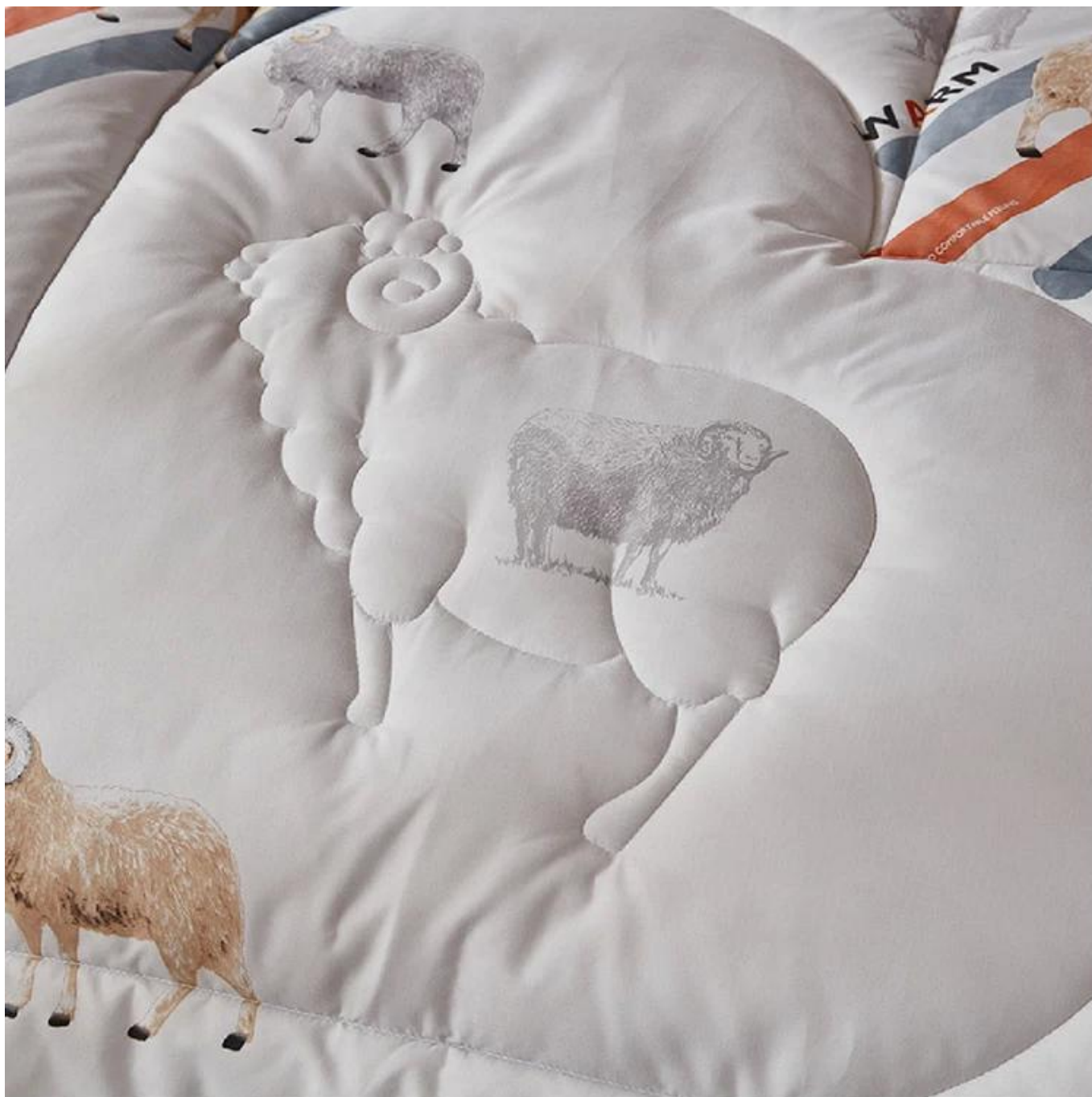
Upgraded Anchor Bands