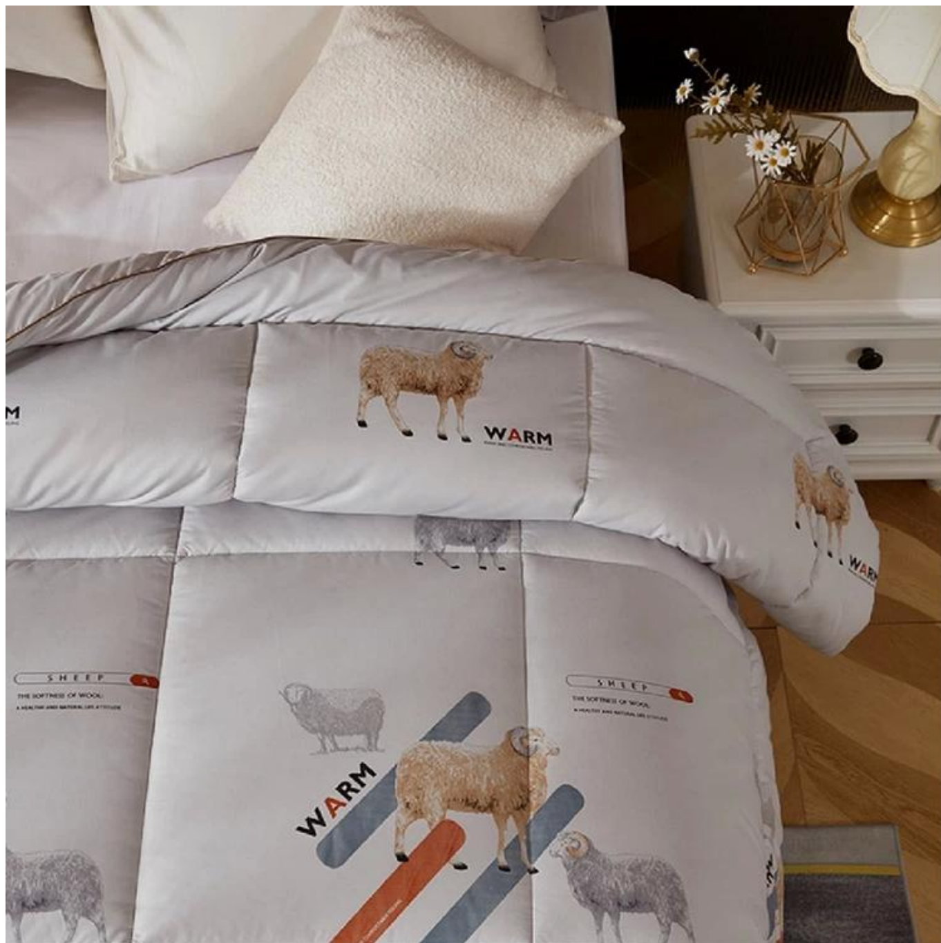
Featured sheep sewing