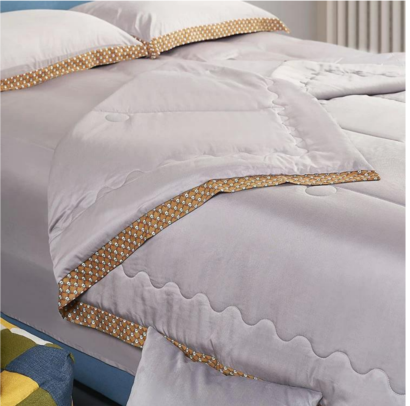
3D spiral fiber filling