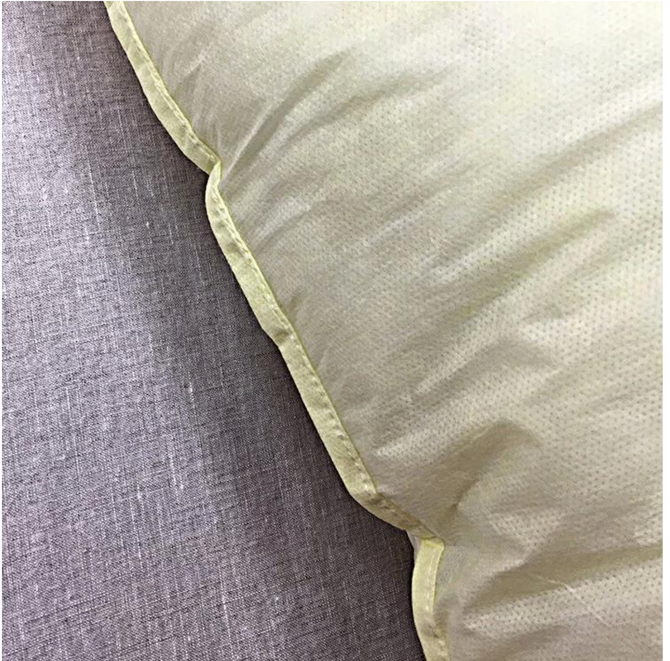
Exquisite hot pressing process