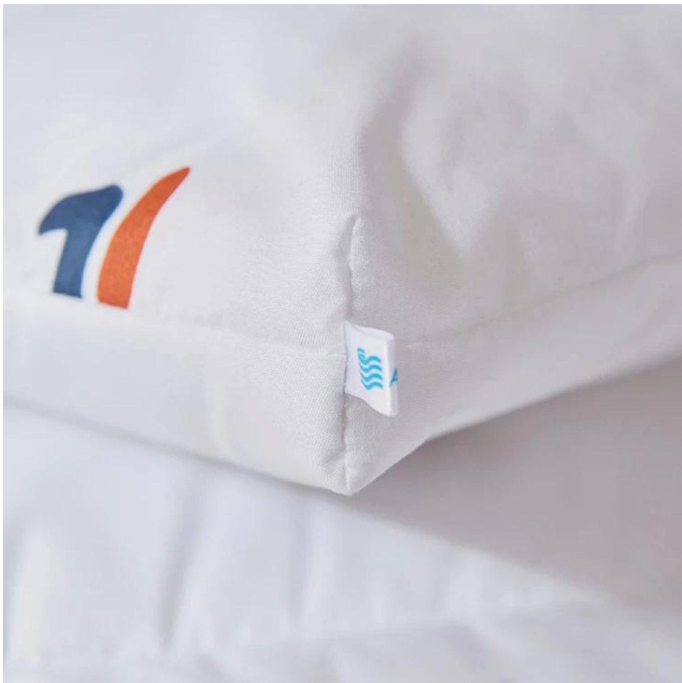
Labels, Marks & Tags