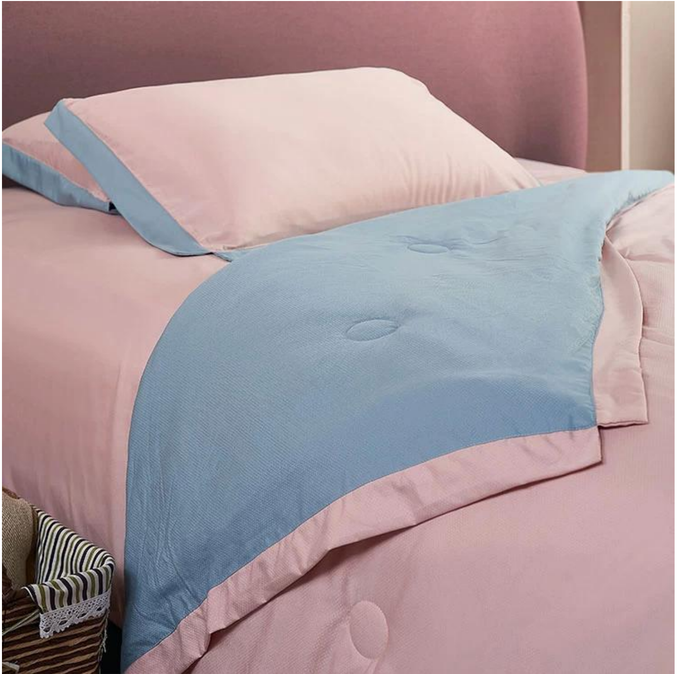
3D spiral fiber filling