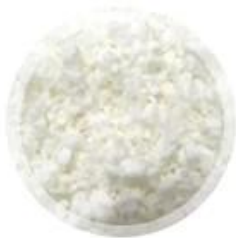
virgin wood spin