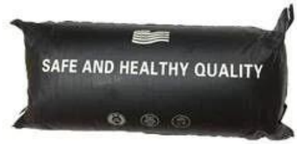
Express logo bag