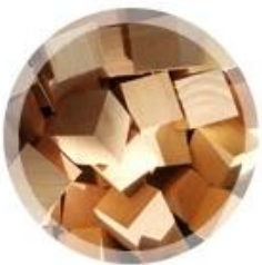
beech wood material