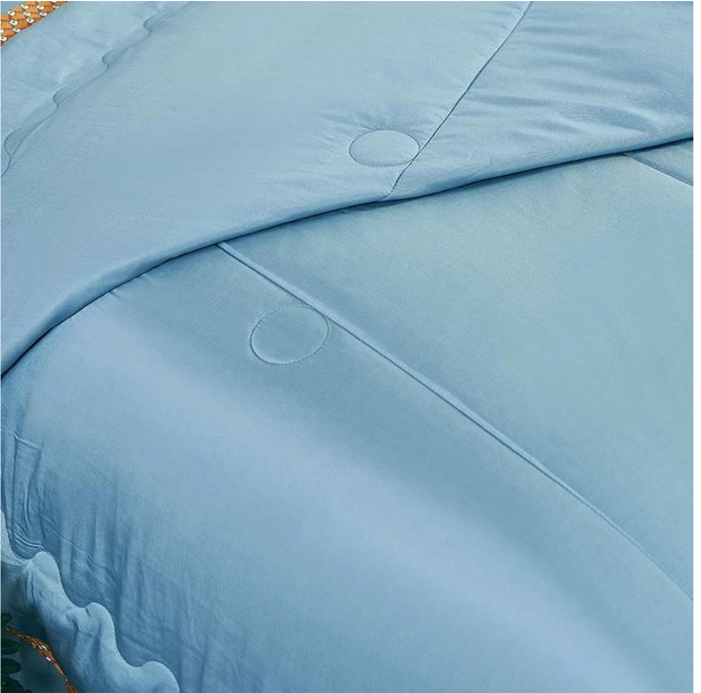
3D spiral fiber filling