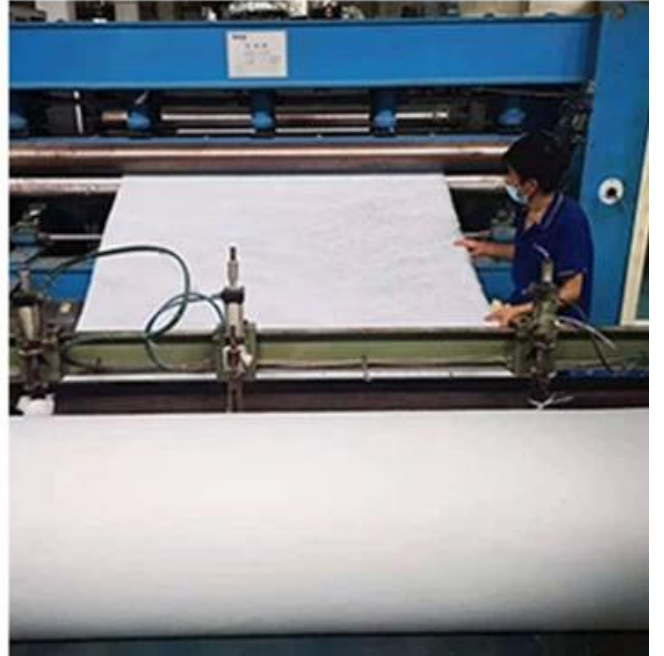
Quilting / Bedding Products Workshop