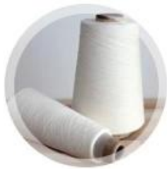
spun into yarn