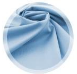
weave into fabric