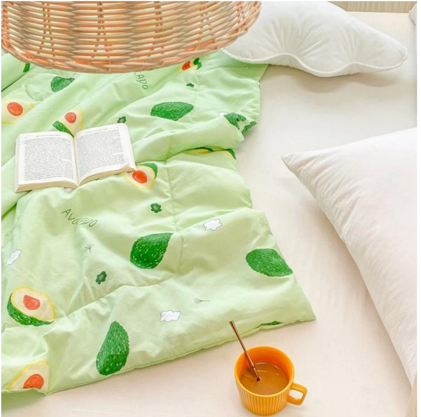
3D spiral fiber filling