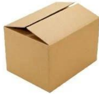
Large parper carton