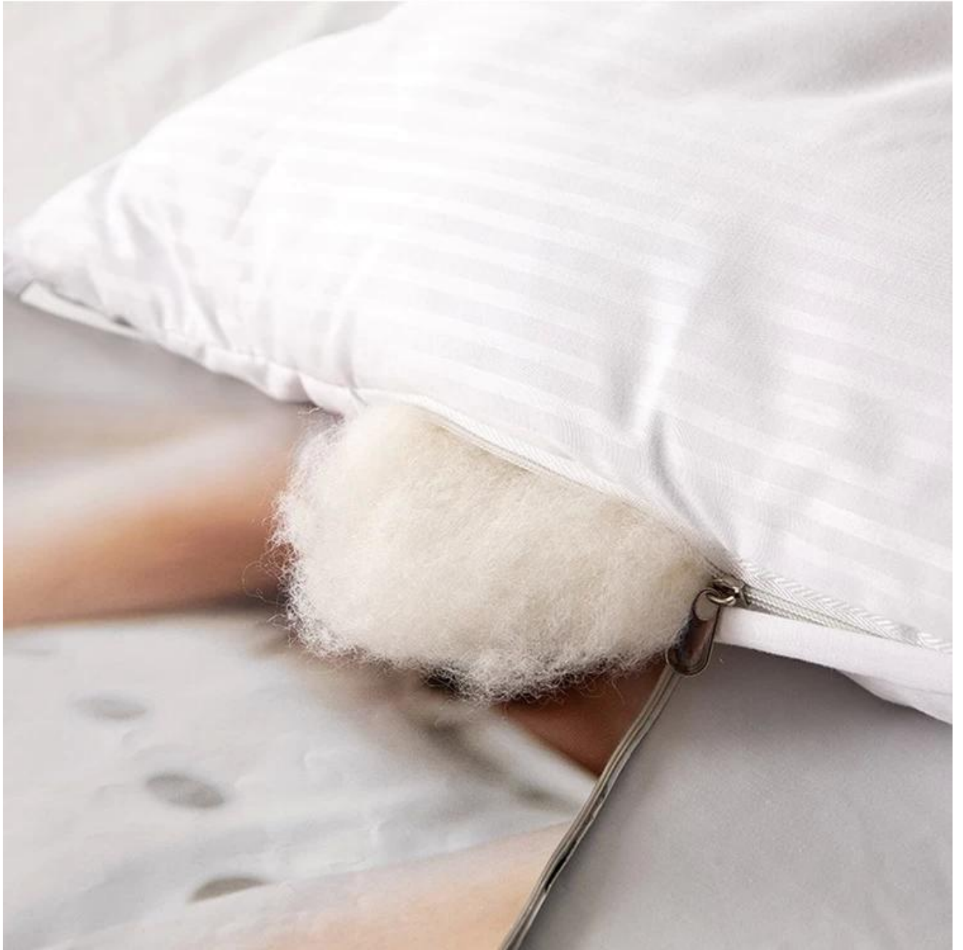
Upgraded Anchor Bands