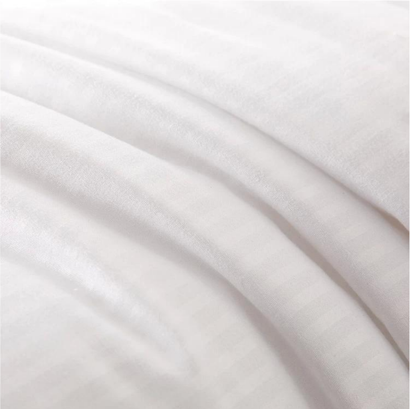
Warm wool duvet insert (wool fiber)