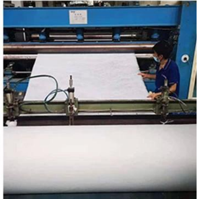
Quilting / Bedding Products Workshop