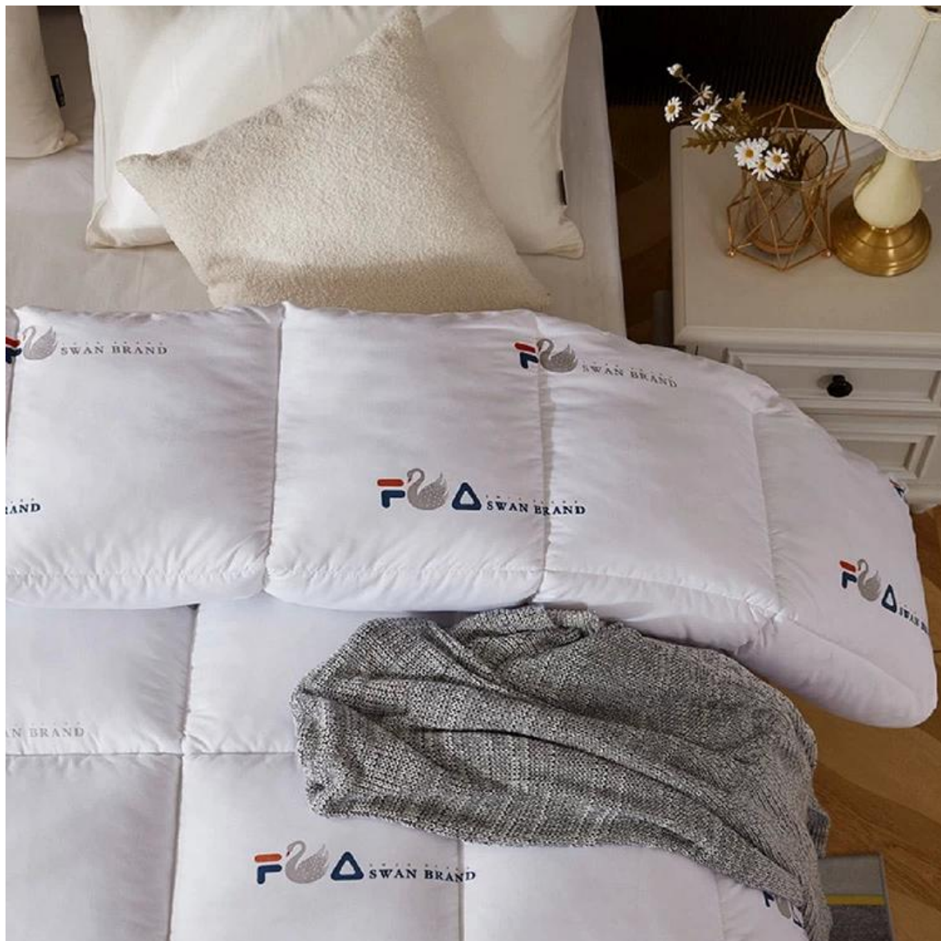
Featured box stitched