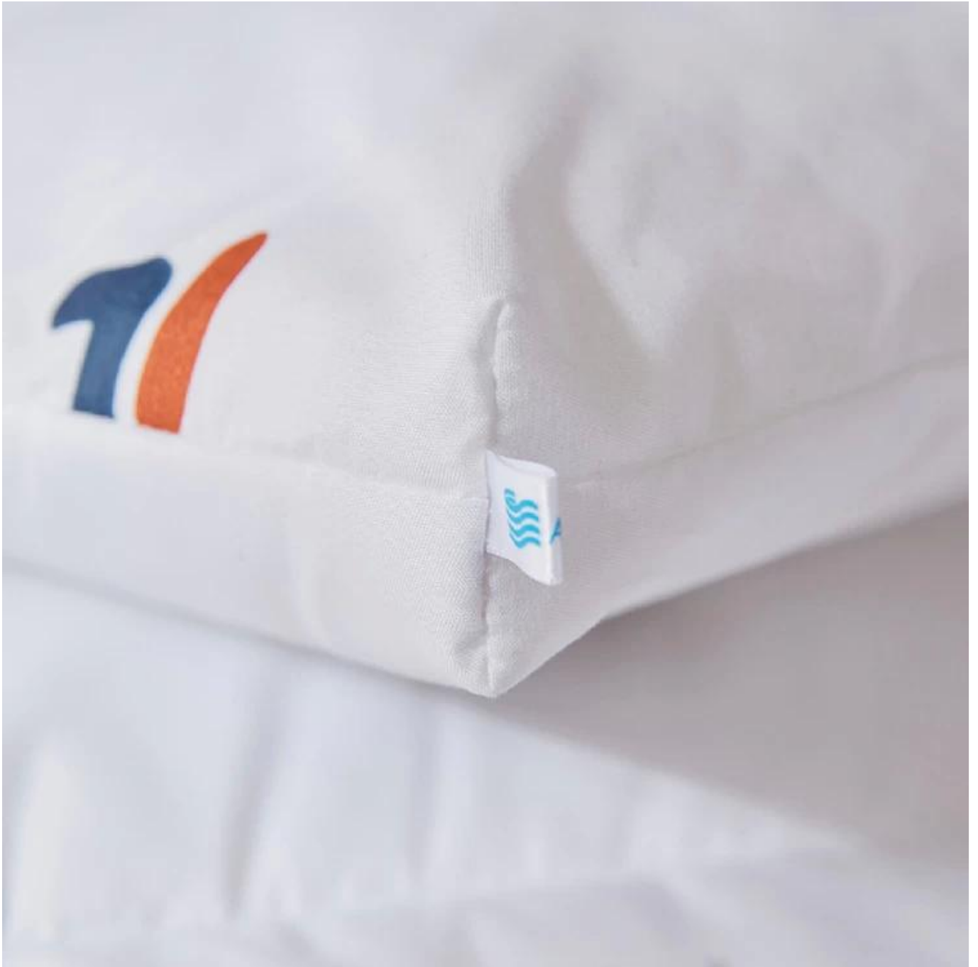
Labels, Marks & Tags