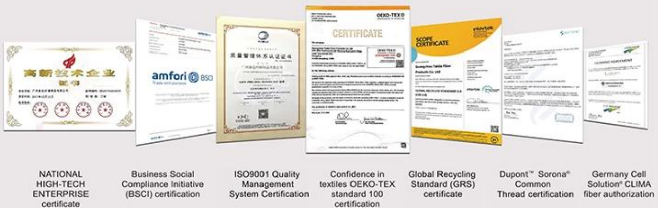
NATIONAL HIGH-TECH ENTERPRISE certificate