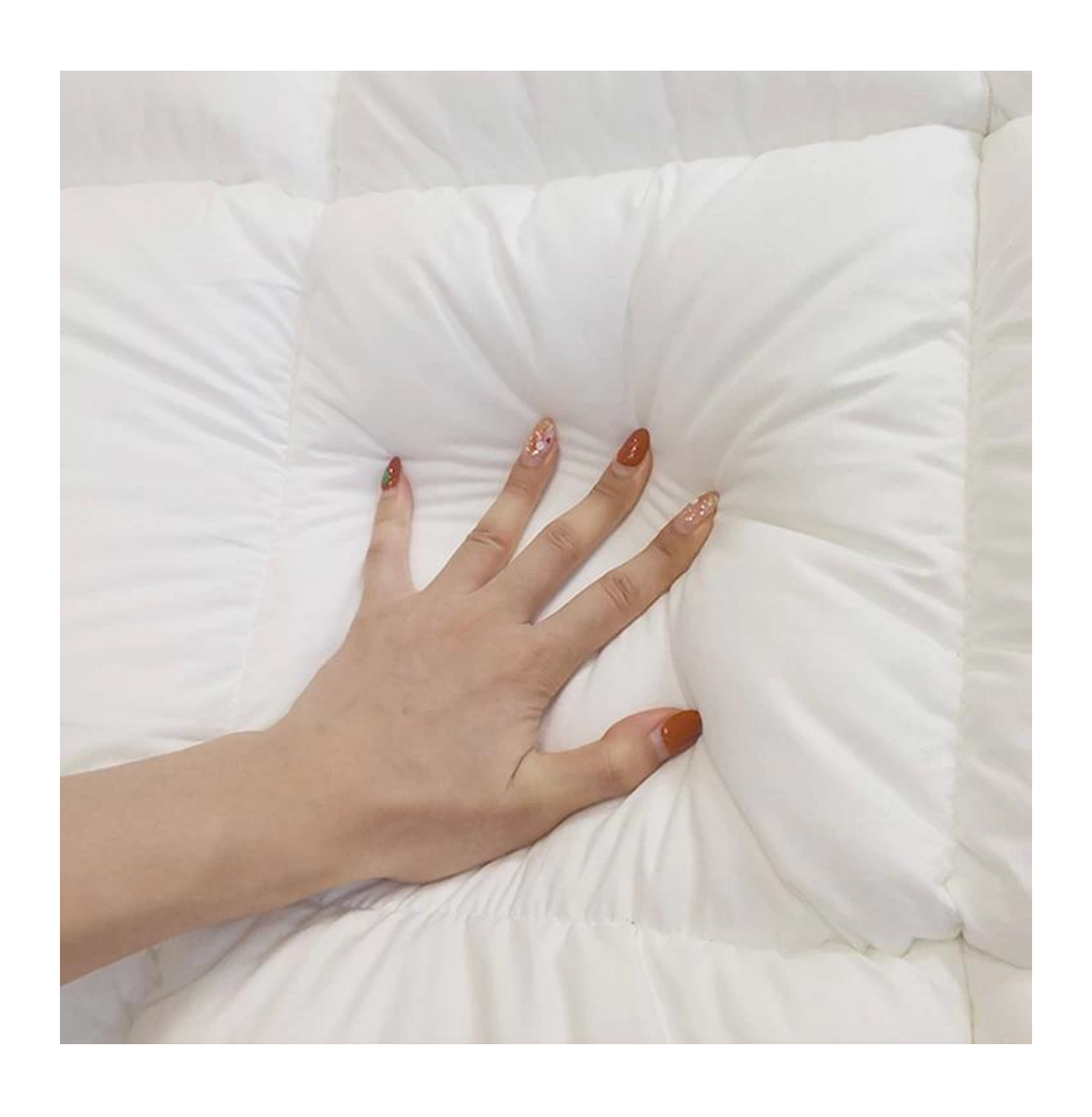
With pocket adapt to mattress depth up to 18 inch