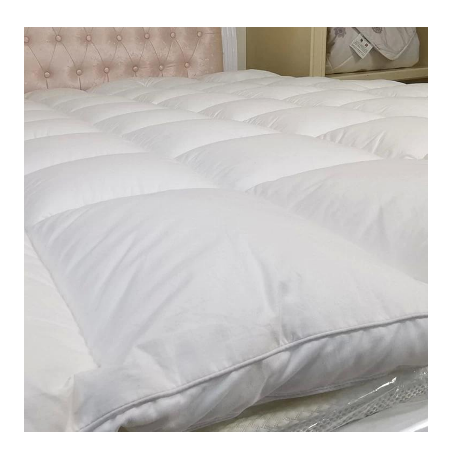
Extra soft, premium, unbeatable comfort, like sleeping on a cloud, cloud-like surface