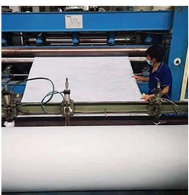
Quilting / Bedding Products Workshop