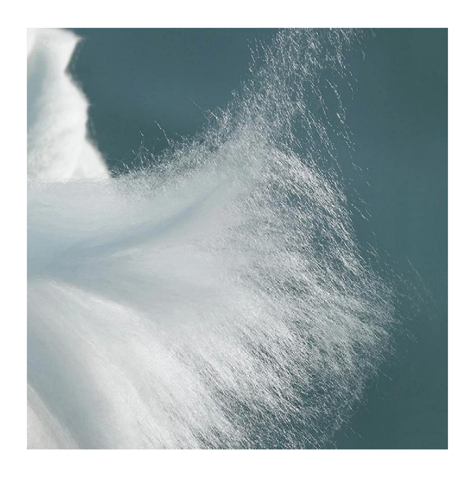
Labels, Marks & Tags