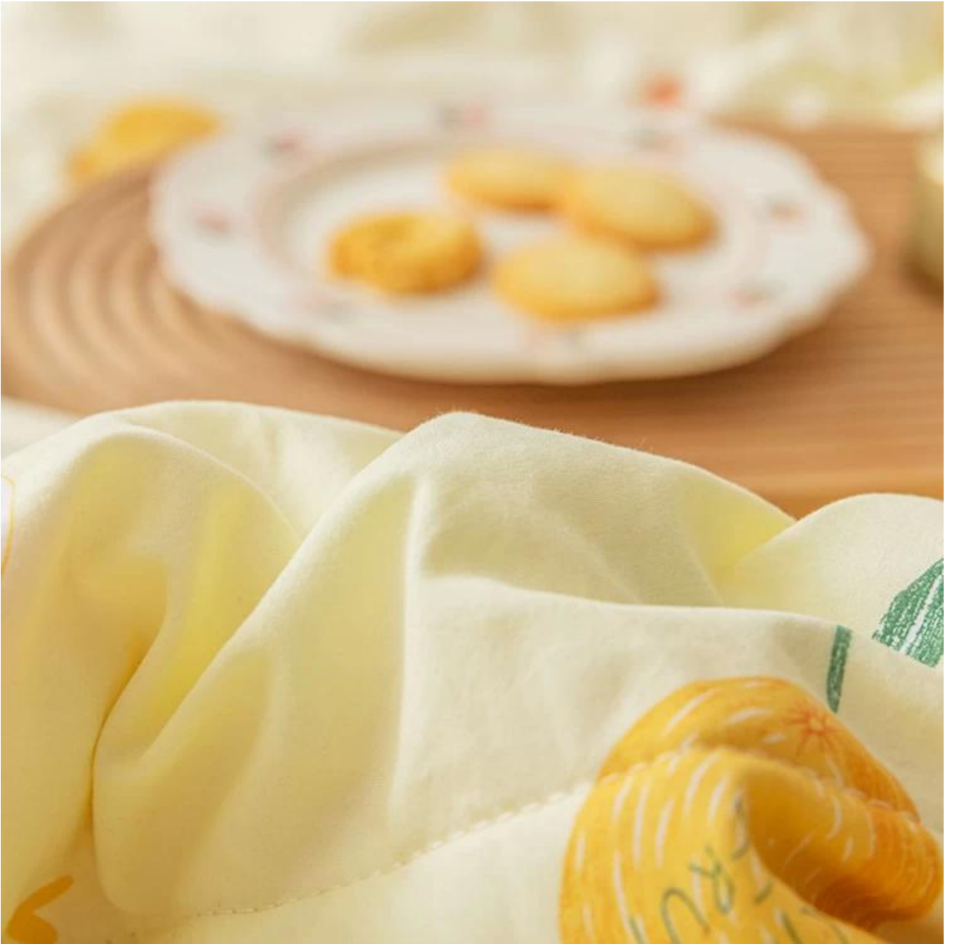
3D spiral fiber filling