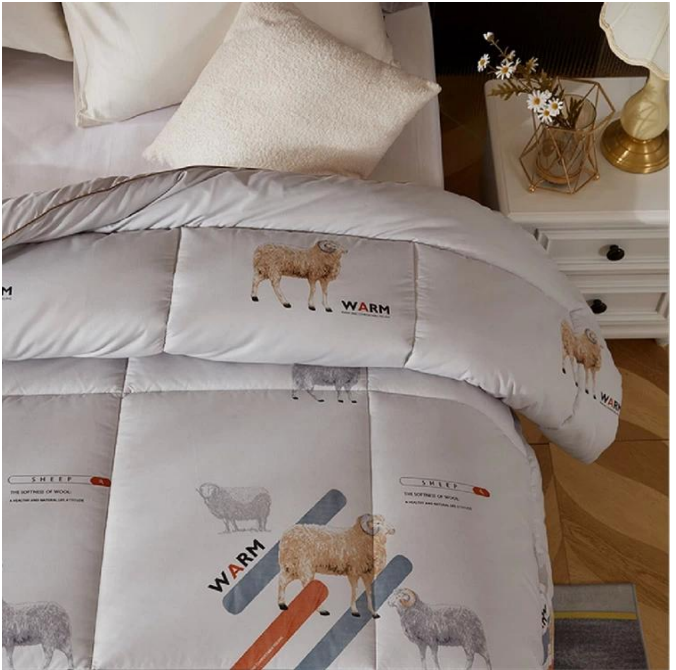
Featured sheep sewing