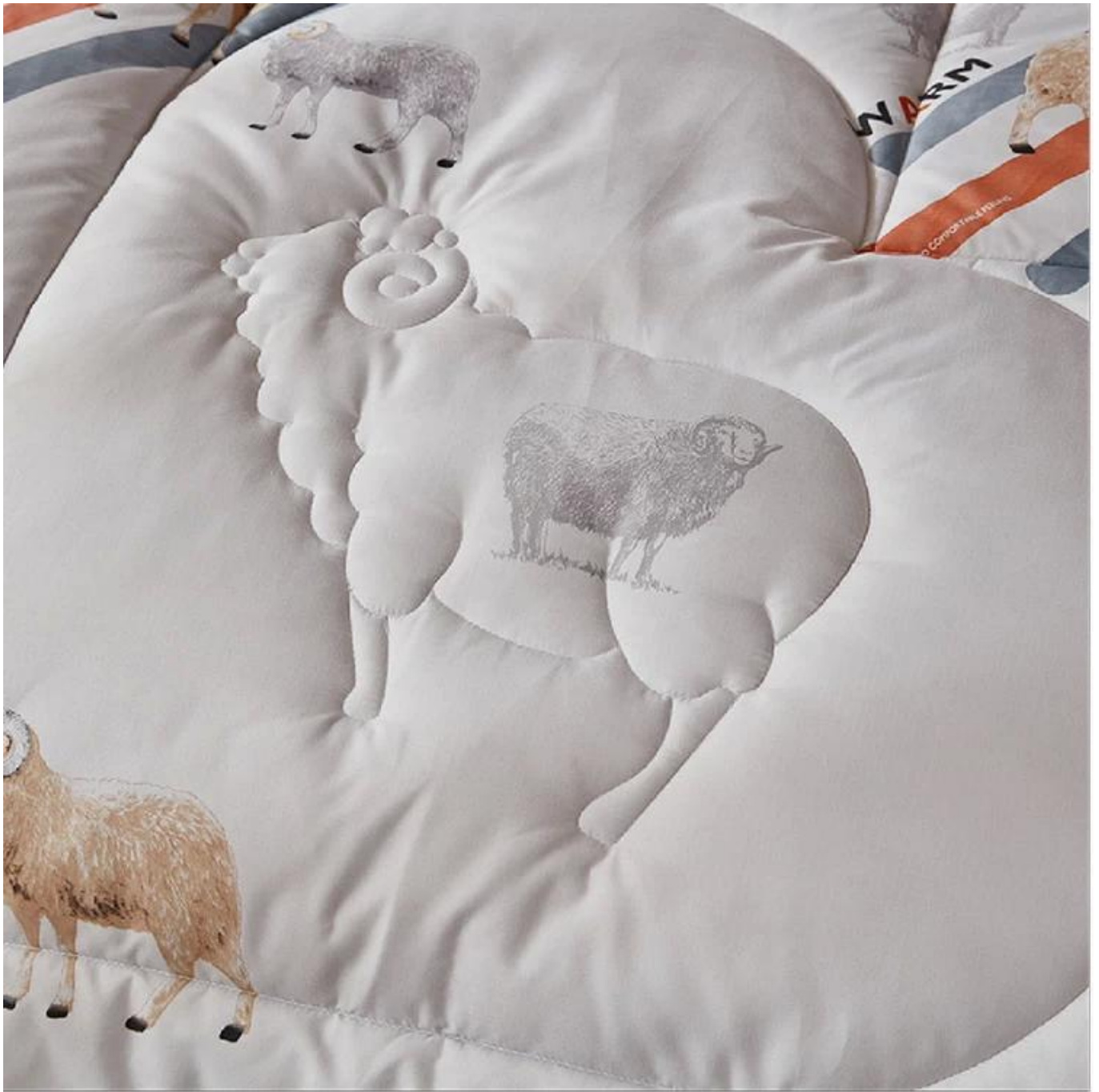
Upgraded Anchor Bands