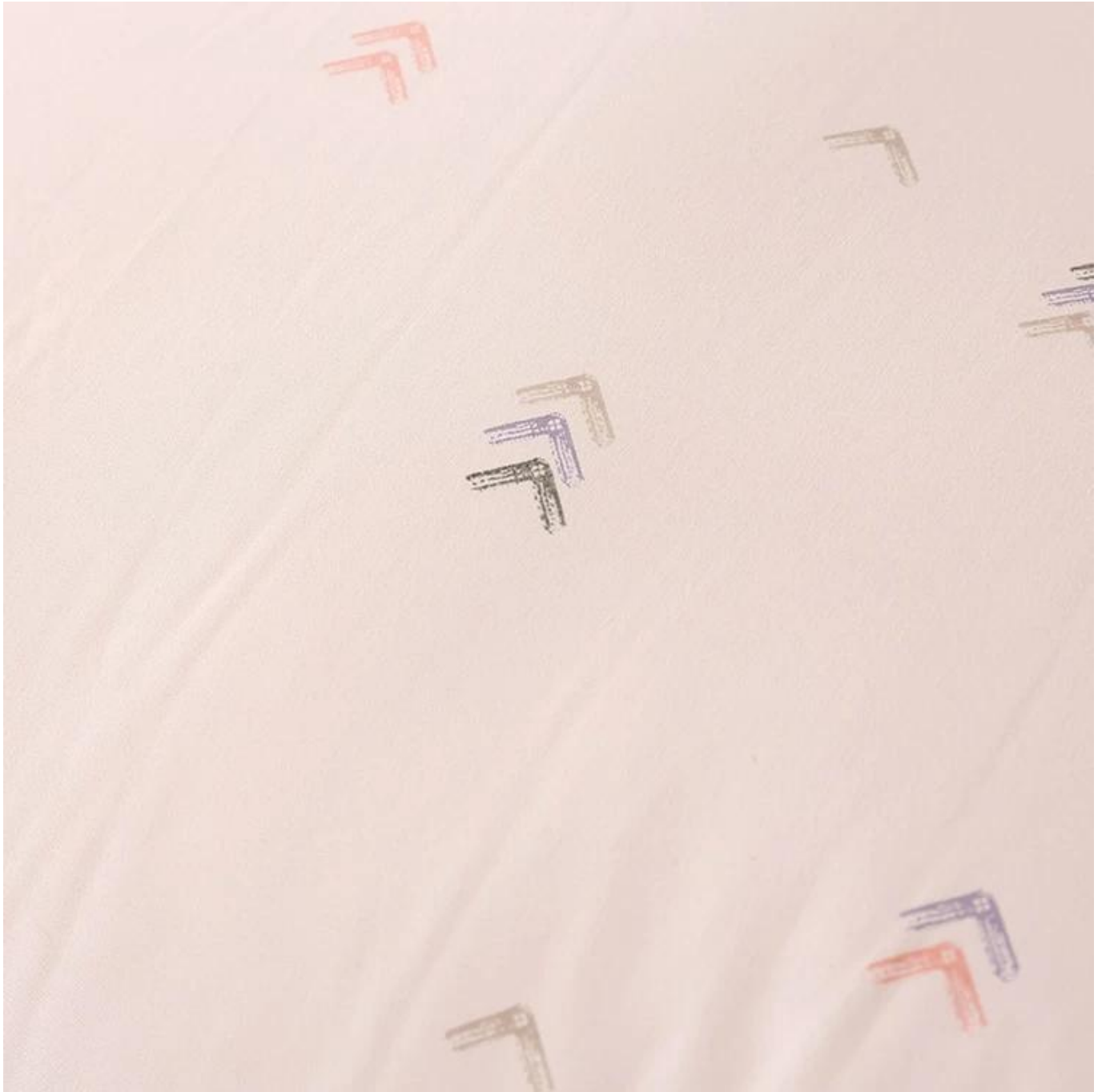
Warm Soybean Fiber Duvet Insert