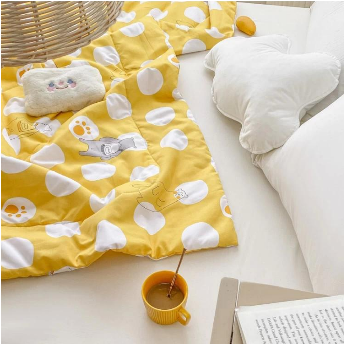
3D spiral fiber filling