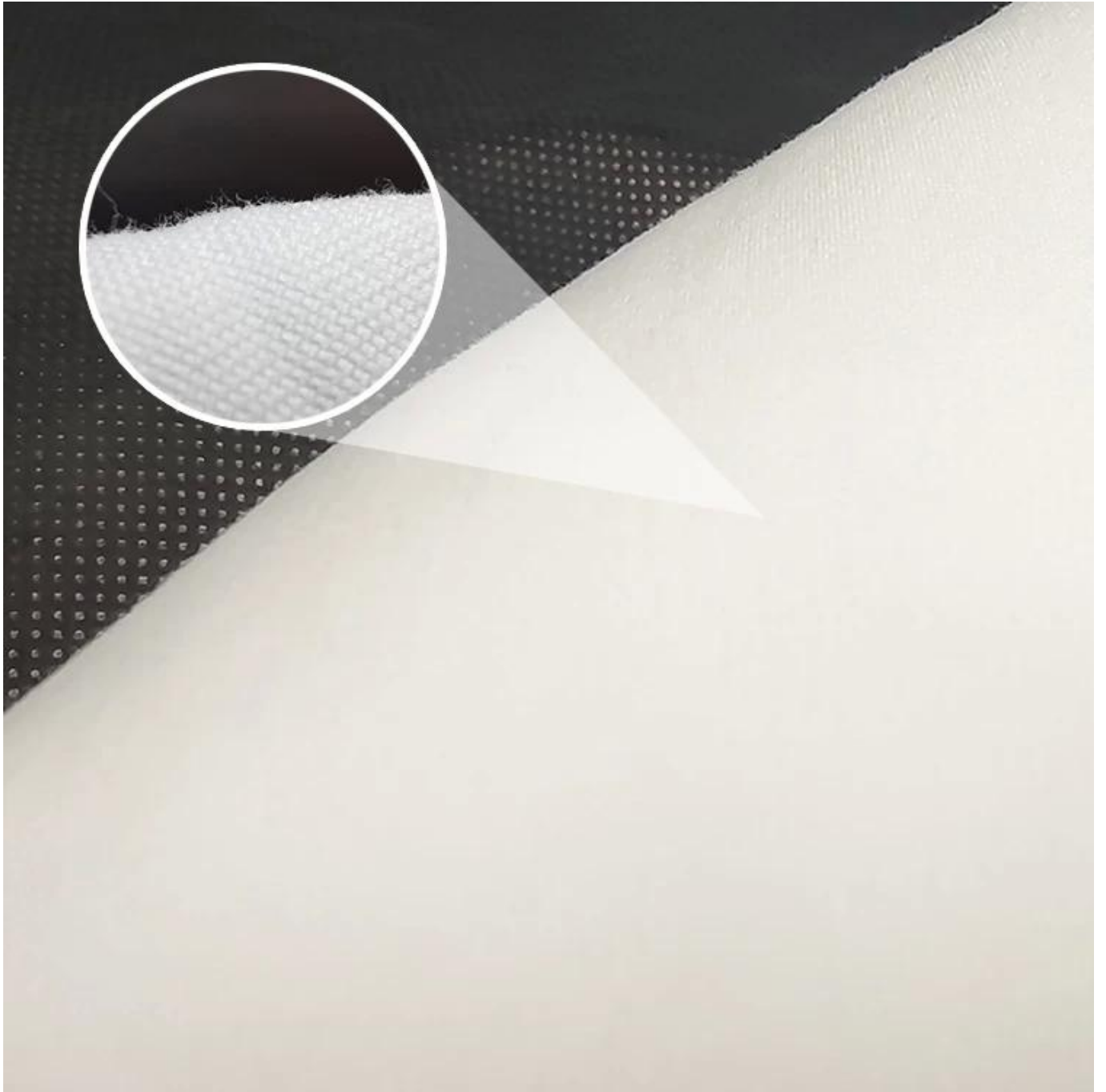
3D spiral fiber filling