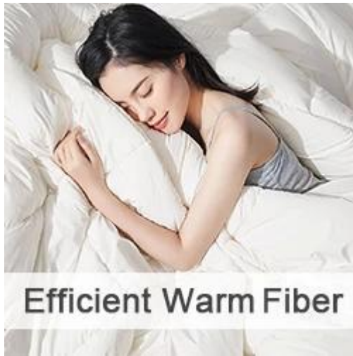
Efficient Warm Fiber

Please contact us for more fiber wadding products!