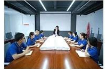
⑨ Finished product