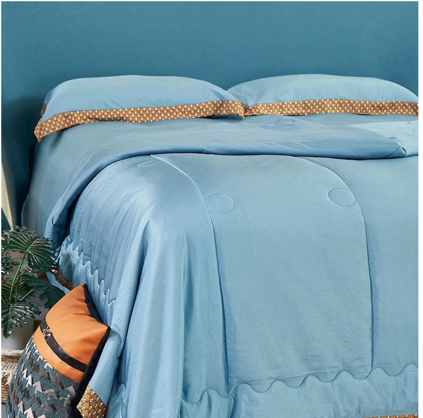
3D spiral fiber filling