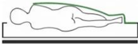
Soft and elastic, no pressure