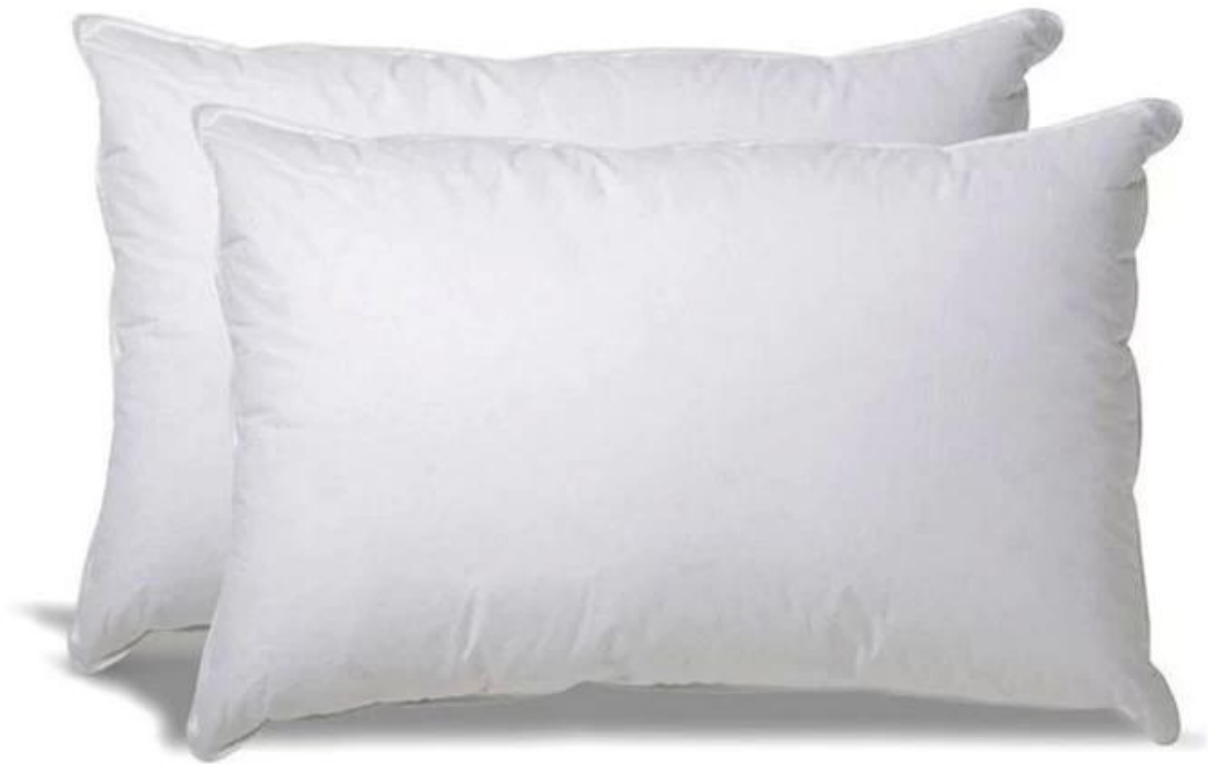
3D spiral fiber filling