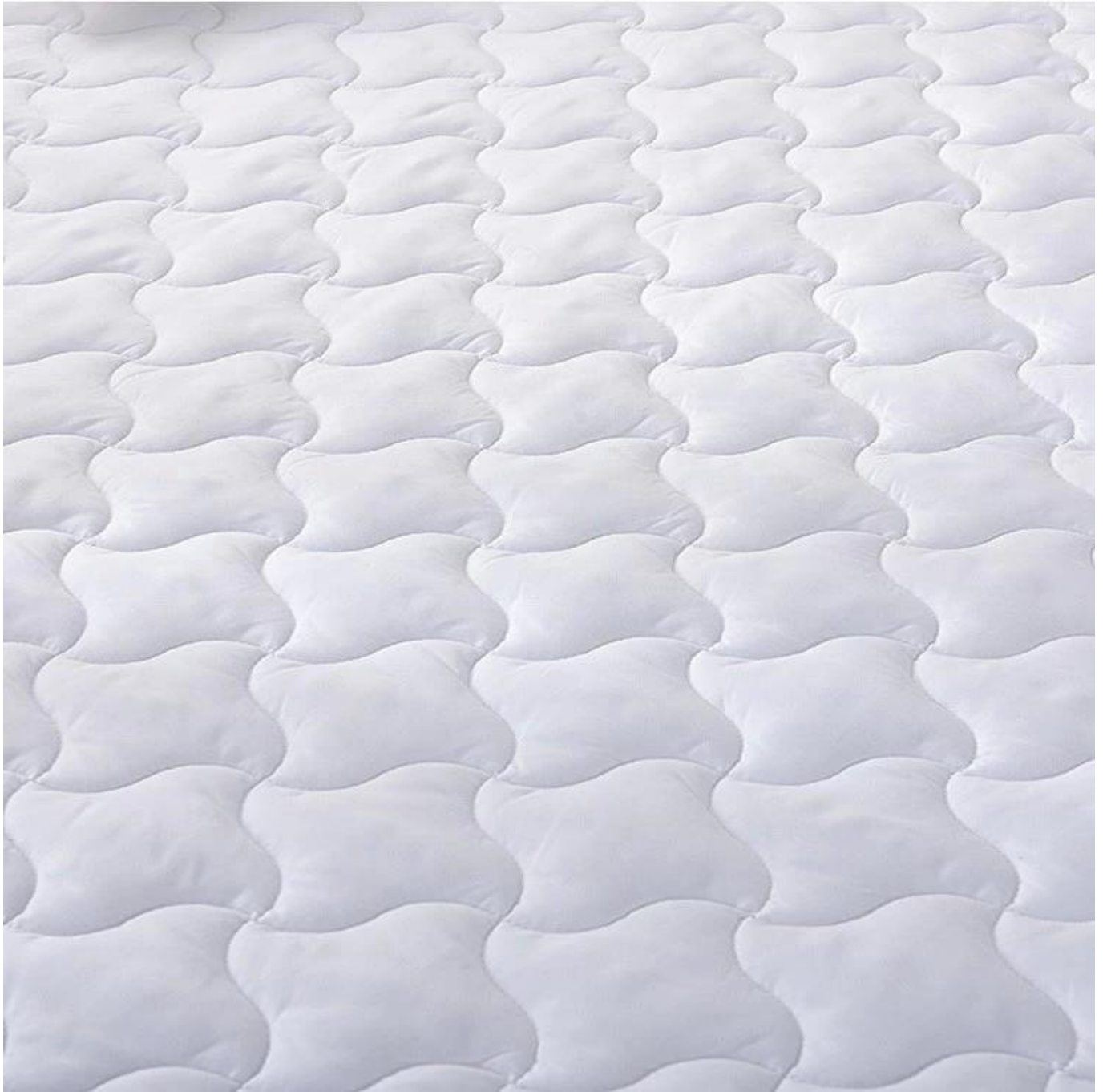
3D spiral fiber filling