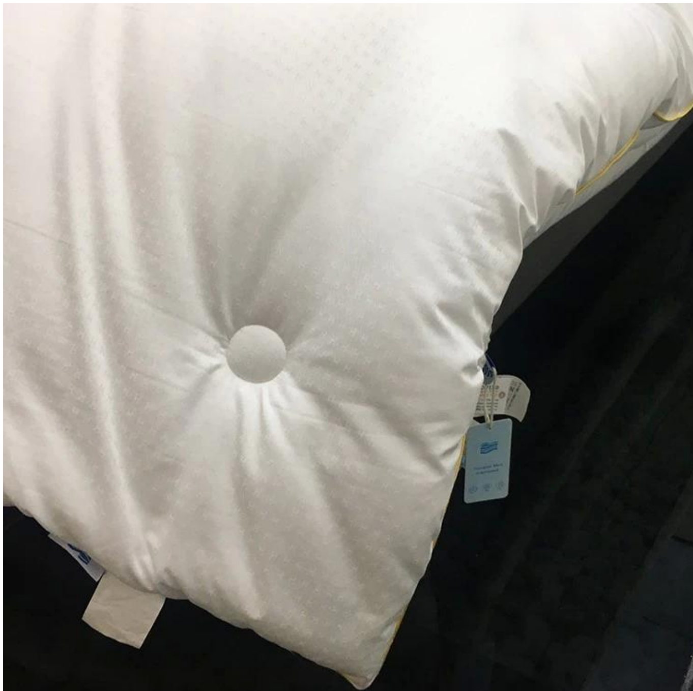
Fluffy high-class hospitality product-soft hotel quilt