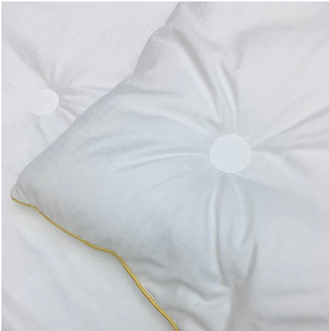
Featured box stitched