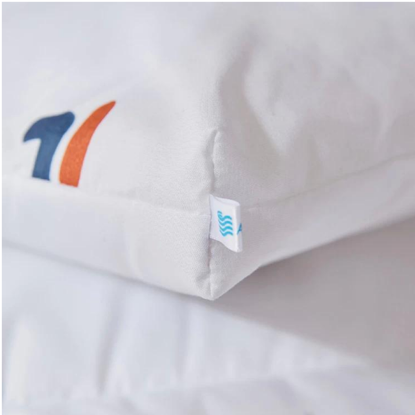
Labels, Marks & Tags