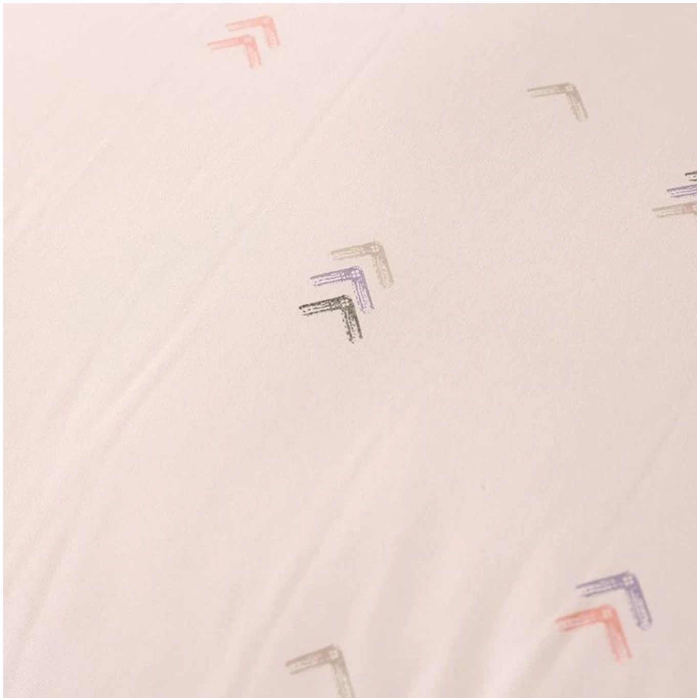
Warm Soybean Fiber Duvet Insert