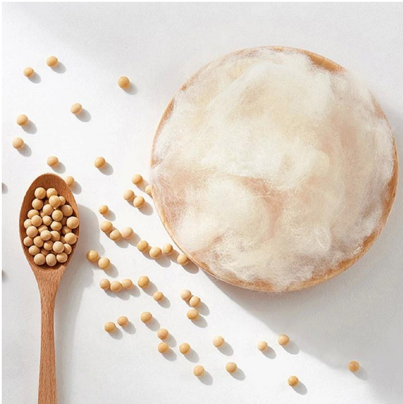
Special Quilted Process