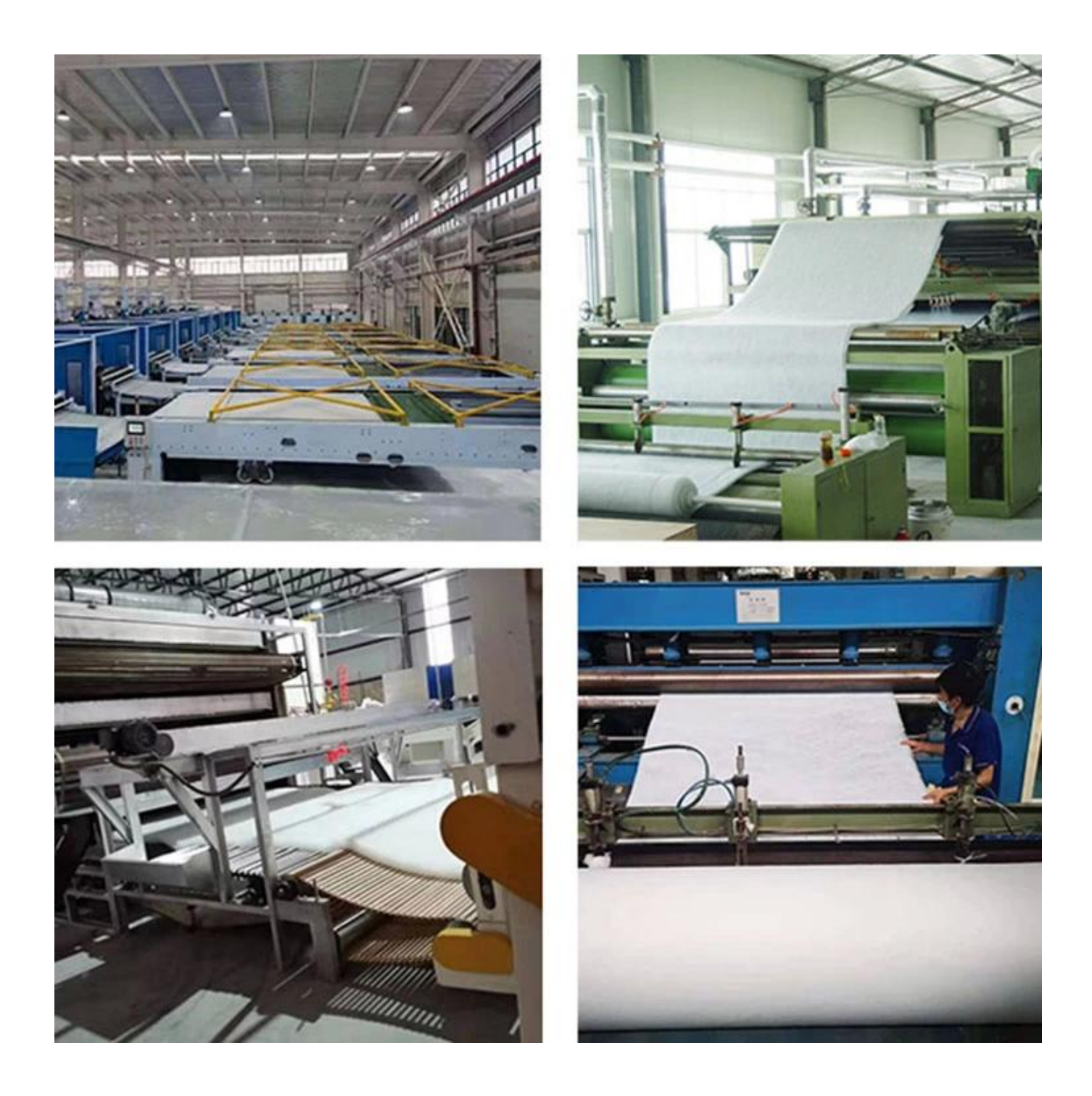
Quilting / Bedding Products Workshop