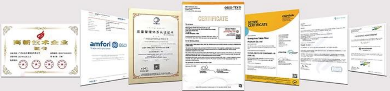
NATIONAL HIGH-TECH ENTERPRISE certificate