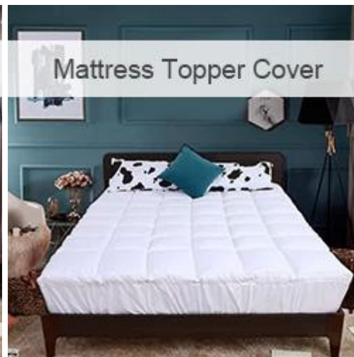
Mattress Topper Cover