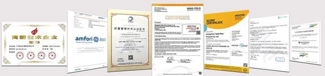
NATIONAL HIGH-TECH ENTERPRISE certificate Business Social Compliance Initiative (BSCI) certification ISO9001 Quality Management System Certification Confidence in textiles OEKO-TEX standard 100 certification Global Recycling Standard (GRS) certificate Dupont™ Sorona® Common Thread certification Germany Cell Solution® CLIMA fiber authorization