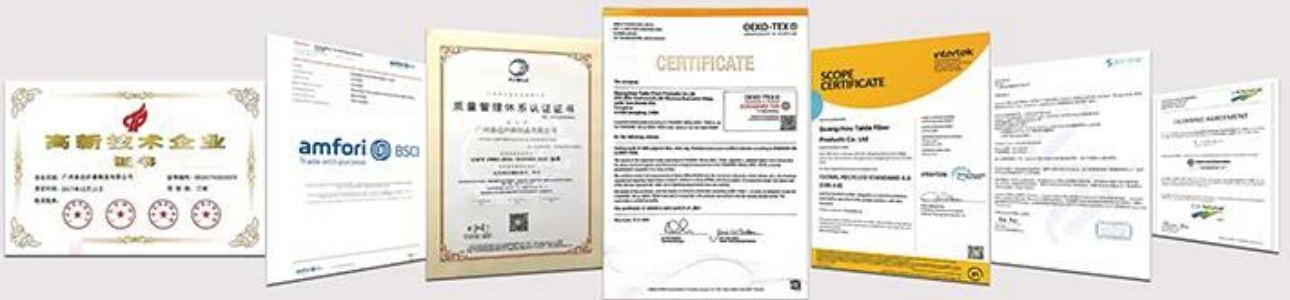
NATIONAL HIGH-TECH ENTERPRISE certificate