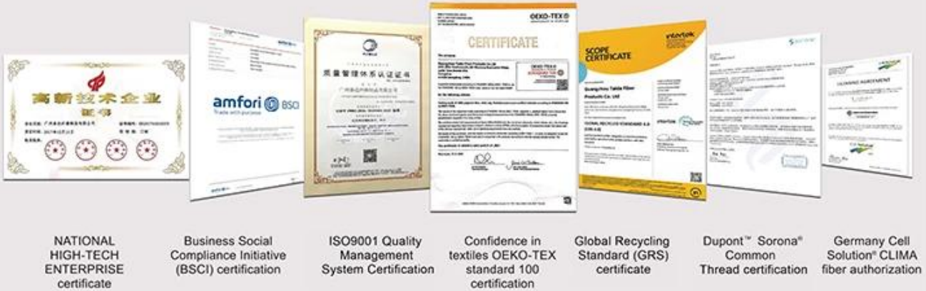
NATIONAL HIGH-TECH ENTERPRISE certificate