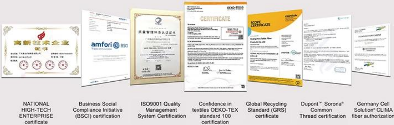
NATIONAL HIGH-TECH ENTERPRISE certificate