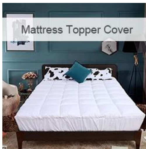
Mattress Topper Cover